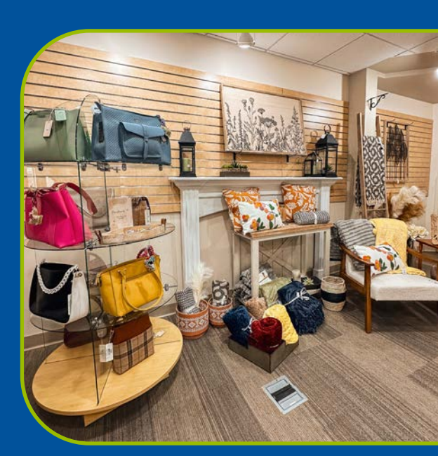
Auxiliary Gift Garden

Moreover, volunteering helps bridge gaps within communities, strengthening the connection between Greene County Medical Center and the people we serve. Whether you're assisting in the Gift Garden gift shop, providing support to patients and families, hosting a blood drive or organizing fundraising initiatives, the role of an Auxiliary member is integral to our success and has a lasting impact on the lives of patients and their families.